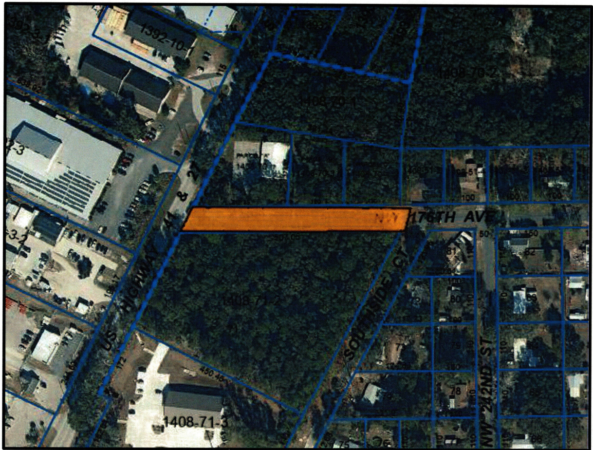
FIGURE 3: NW 176 AVE