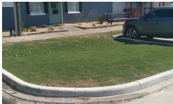
Sidewalk, Curb, Gutter & Drainage Improvements