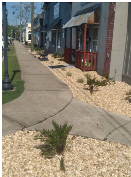
Downtown Landscaping Improvements

In 2021-2022, a local non-profit agency, the Heart of High Springs, planned and funded a mural festival which was held in March 2023. Several buildings in the CRA district have now been beautified with murals celebrating the history of High Springs.